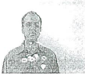
1st Party न्यासकर्ता

Reg. No. 4919 Peg. Year 2005-2006 Book No. 4